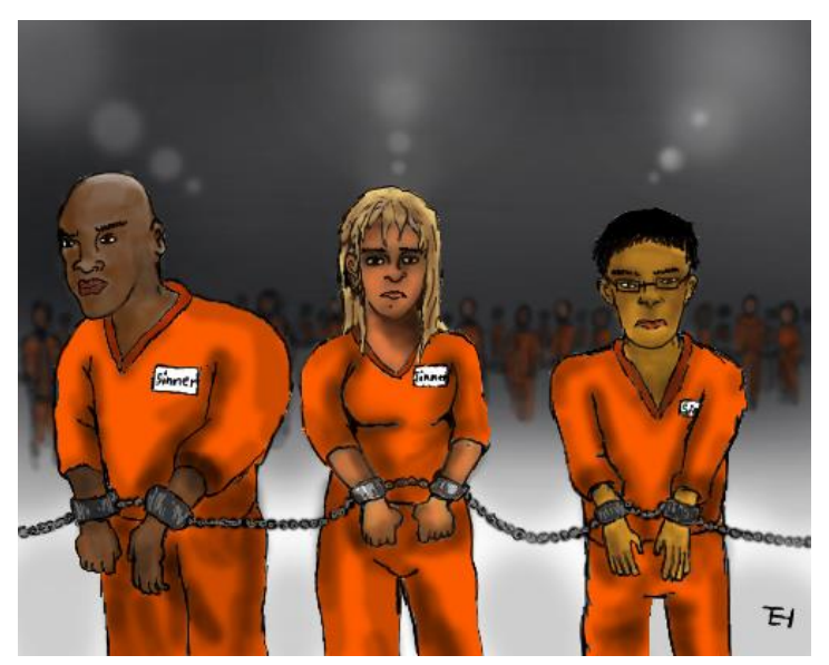
We are all sinners!

Romans 3:23 aw pî aw mbire jàk maarra, aw èe 'mita yey gesi e tâa daw a gin Fay gi.