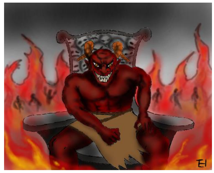
There is a cost for sin!

John 3:36 Nit yey goosu di Hàm gi, dii ni gûyrra tâam timgbàri. Nit yey tâa ti ragu tuy di Hàm gi ba, ge kpàa gûyrra ba, amma ngòlnji Fay dii a gin wàa.